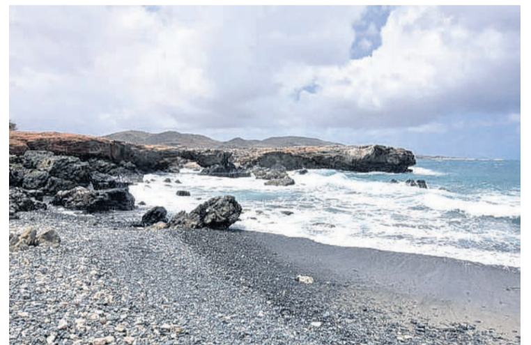
the stones and the northern take a picture with your ocean that stretches out friends or family! in front of the beach and

This beach forms part of the Arikok National Park and is therefore a site that is preserved. This is why it is also relatively untouched by commercial influences. Despite being called a beach, do note that it is not advised to swim in the water, as the current is very strong and can easily stray you further in the wild ocean. However, you can still enjoy a spectacular view of